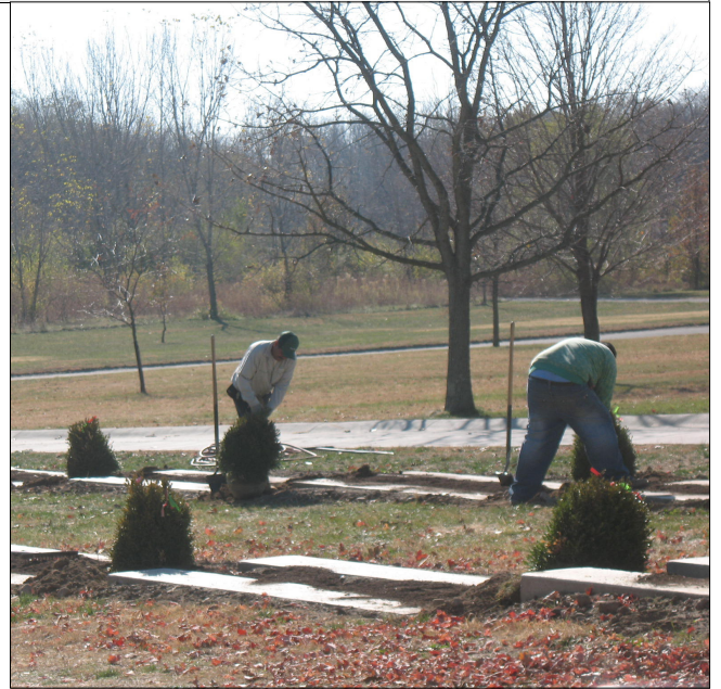
Employees from Scarff's Landscape install new plants in Section 41

Section 41 is situated in the southwest corner of the cemetery near an open prairie that leads into a ninety acre wooded area reserved for future development. This area features pre-poured concrete foundations to accommodate upright monuments. Another feature to this area is the overall landscape plan around the monuments. Plants such as Green Mountain Boxwood, Moonbeam Coreopsis, Ruby Star Cone Flower, Autumn Joy Sedum, Blacked Eyed Susan, Shasta Daisy, May Night Salvia, and Forester Feather Reed Grass will provide a beautiful and seasonal splash of color to the area. The plants and installation were purchased from Scarff's Landscape of New Carlisle, Ohio.